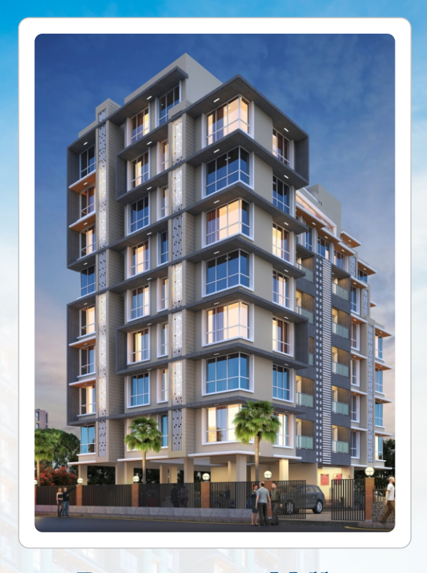
Damyanti Villa Goregaon West