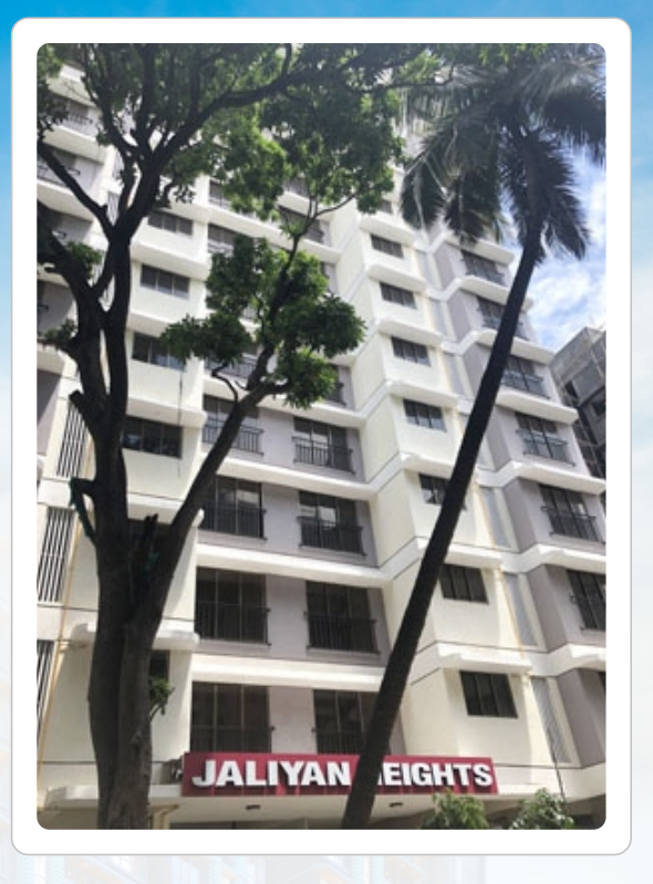
Jaliyan Heights Borivali East