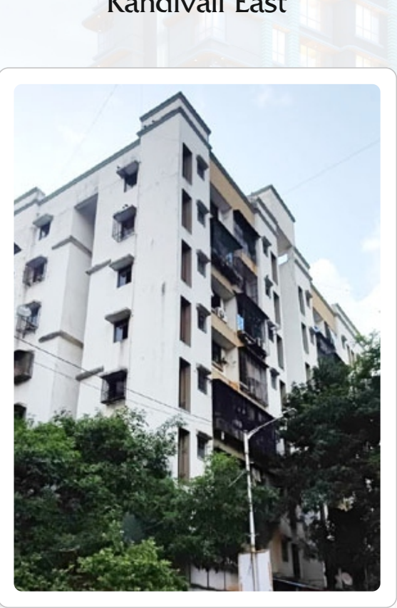
Parth Residency Malad East