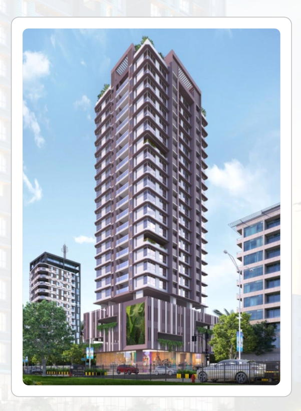
Shambhoo CHS Andheri West