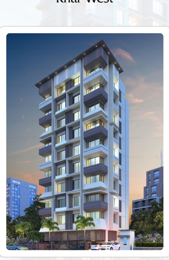
Balsam CHS Ltd. Vile Parle East