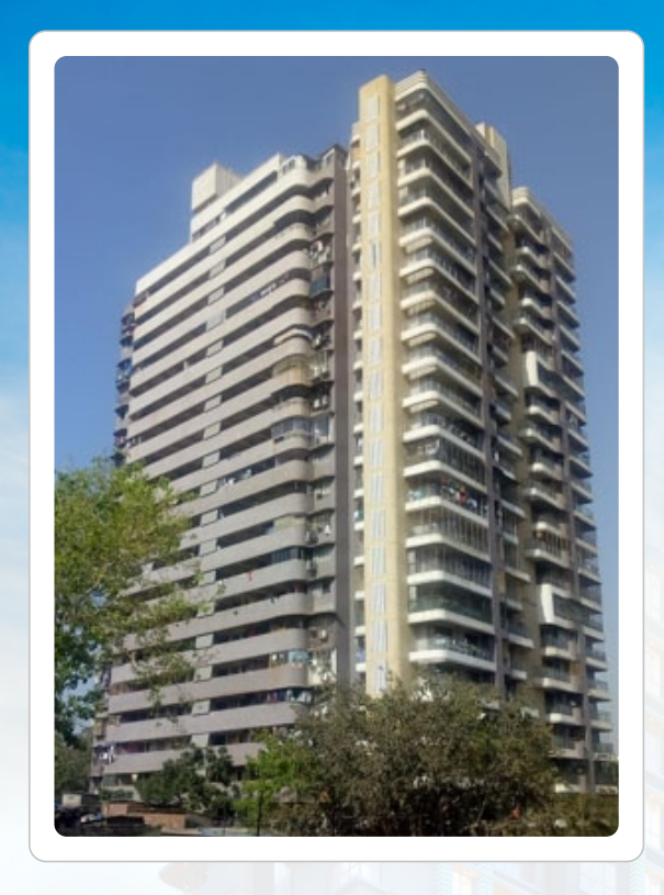
Solitaire Homes I Kandivali East