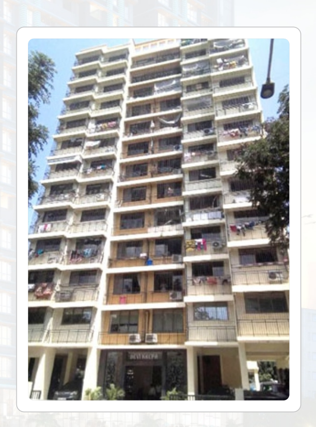
Devikrupa Malad East